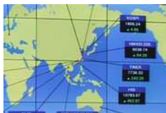
China stocks slammed by earnings, economic fears