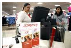
Soft U.S. retail sales, manufacturing seen