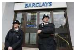
U.S. criminal probe in Libor scandal: report