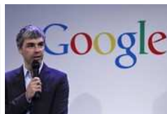
Next week focus is on Citi, Google, 'fiscal cliff'