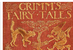
A Grimm tale from the euro zone